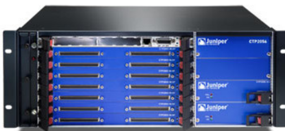
CTP2056 Circuit to Packet Platform